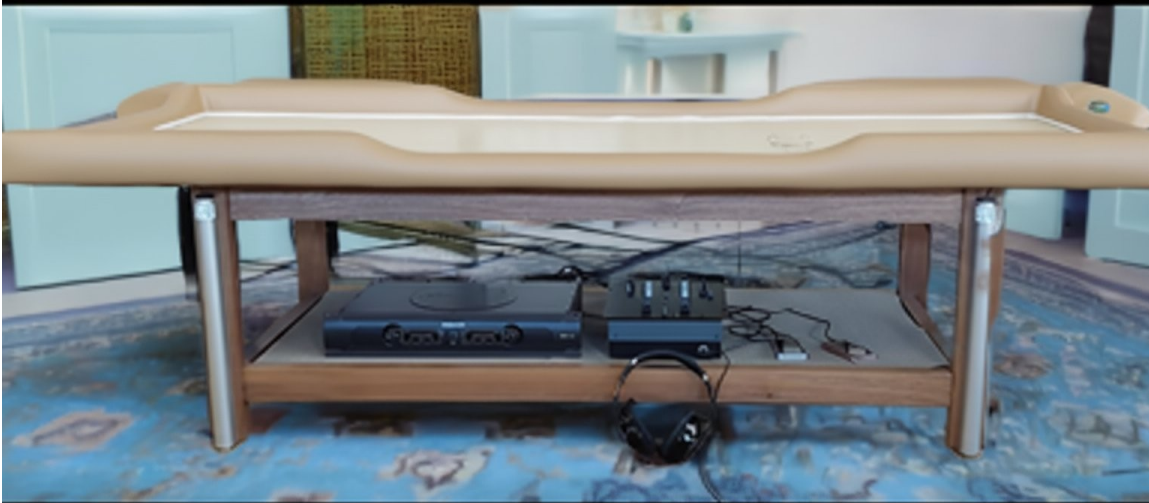
Walnut base with buff rails. Audio stack (amplifier, mixer, headphones) integrated on the lower shelf.

The Liquid Sound Table isn't a single product. It's a complete system. When the table arrives, it's ready to use. Here's exactly what's in the crate and why each piece matters.